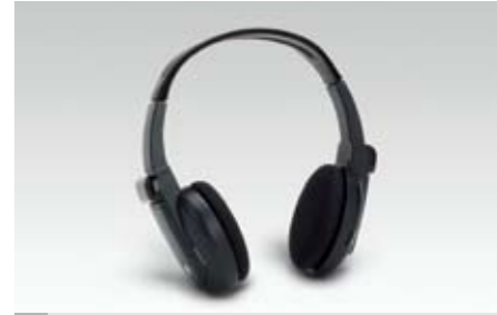
38 DVD Head phones 86247XA00A Spare headphone for multi-media system.