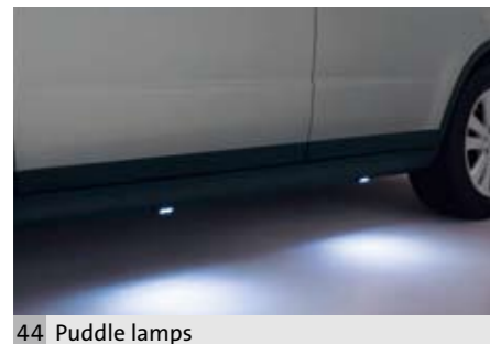
44 Puddle lamps H471SXA100

For side and partial under vehicle illumination. Lights are activated when unlocking or opening any of the doors.