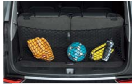
29 Cargo net (Vertical) F551SXA000 For a clean and tidy luggage area.