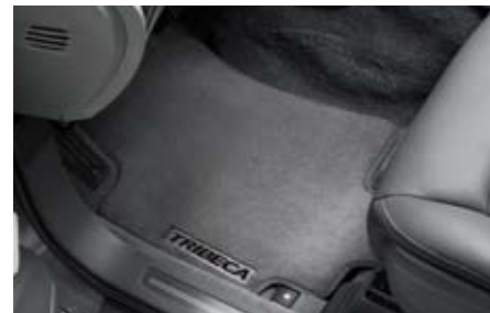
31 Carpet mat (Grey) J505EXA200 / J505EXA210 / J505EXA200RH / J505EXA210RH Custom fitted carpet mat with logo.