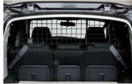
25 Dog guard F551SXA200 Separates cargo room from passenger area, applicable for ISOFIX child seat.