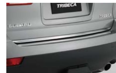
9 Rear gate end moulding E755EXA200 Stylish chrome finished moulding.