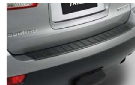
8 Cargo step panel E771SXA100 Rugged plastic resin cover helps protect upper surface of rear bumper.