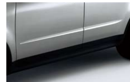
4 Side moulding E755EXA100 Stylish chrome finished moulding to be installed on the passenger doors.