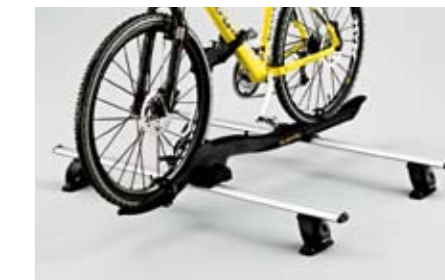
18 Bicycle holder (Barracuda) E361ESA501 Bike holder with aerodynamic design, easy bike installation. *Aluminium carrier base required