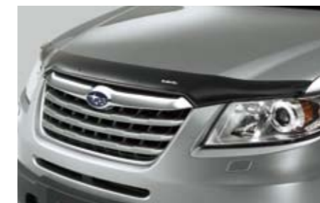
1 Hood deflector (Acrylic) E231SXA100 Durable acrylic plastic and wraparound design help protect the hood from stone chips.