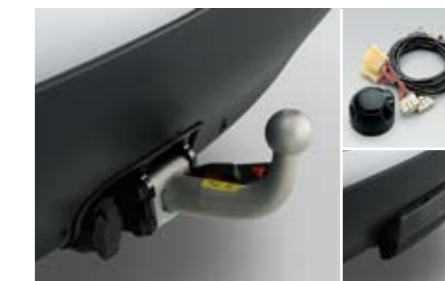
22 Trailer hitch (Detachable) See Application List Maximum towing capacity 2,000 kg.