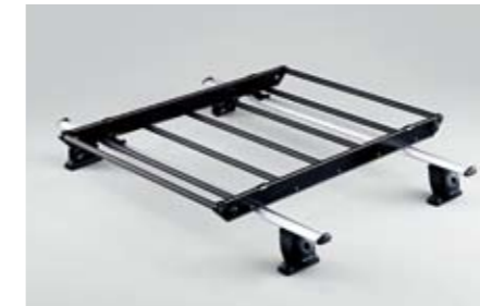
12 Roof rack platform E361EAG700 Enhances your load carrying drastically. *Aluminium carrier base required