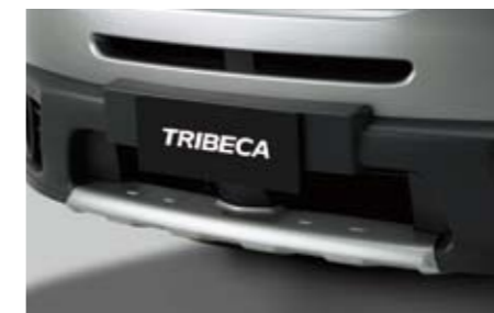
2 Front bumper under guard E551SXA000 Helps protect your vehicle from stone-chips.