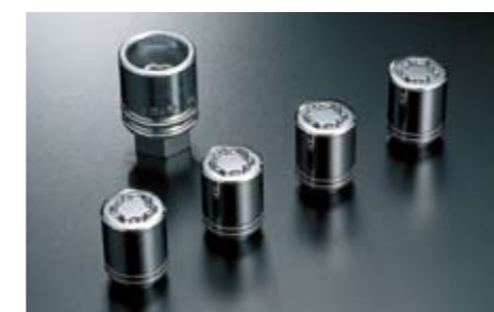
10 Wheel lock kit B327EYA000 Helps prevent alloy wheels and tyres theft.