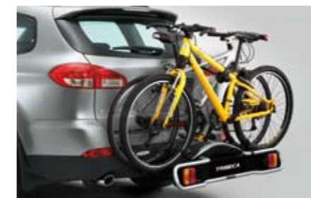
20 Rear bicycle holder (2 bike) E365EFG600 / E365EFG700 Transports 2 bikes on tow ball. *Trailer hitch required