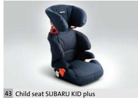
43 Child seat SUBARU KID plus F410EYA212

Extra protection in case of side impact.