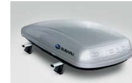
14 Transport box (Short) E361EYA801 Size: 1,792 x 797 x 355 mm. Volume: 380 litres. *Aluminium carrier base required