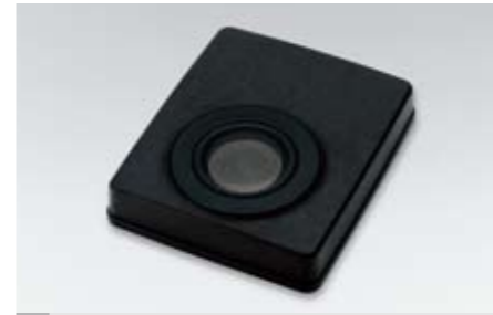
39 Subwoofer/Amplifier H630SXA000 Adds 120 watts of power, and delivers super bass sound you not only hear but feel. *Requires Subwoofer mounting kit