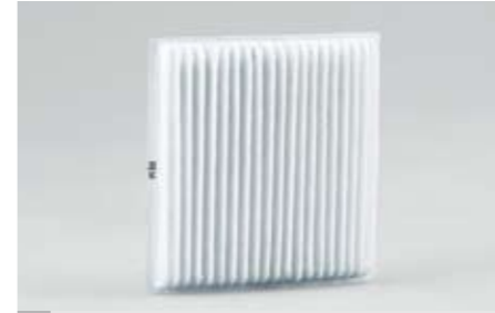
36 Anti dust filter 72880AG000 Helps reduce dust and pollen infiltration into the vehicle cabin area. For the best result, it is recommended to replace the filter once a year or every 12,000 km. *For replacement of the originally equipped filter