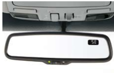
34 Auto-dimming compass mirror H501SXA100 / H501SAG300 Includes electronic compass. Mirror darkens automatically when headlights are detected from the rear of the vehicle.