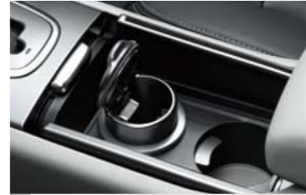
35 Ashtray (Cup holder type) F6010AG000 Cup type ashtray exactly fits the centre cup holder.