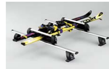
16 Ski attachment (Maximum 4 sets) E361EAG500 For 4 sets of skis or 2 snowboards. *Aluminium carrier base required