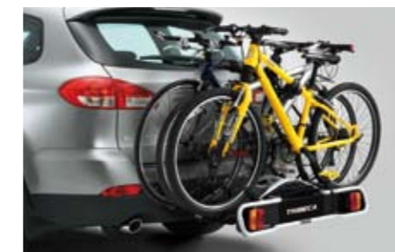
21 Rear bicycle holder (3 bike) E365EFG800 / E365EFG900 Transports 3 bikes on tow ball. *Trailer hitch required