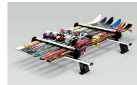
15 Ski attachment (Maximum 6 sets) E361EAG550 For 6 sets of skis or 4 snowboards. Usable width: 640 mm. *Aluminium carrier base required