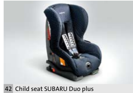
42 Child seat SUBARU Duo plus F410EYA002