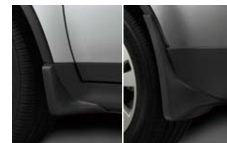
6 Splash guard (Front & Rear set) J101SXA001, J101SXA200 Helps protect your vehicle from mud and snow. *Requires brackets for rear set