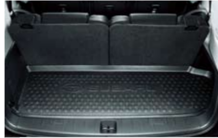
26 Cargo tray (5+2 passengers) J511EXA100 Protects cargo area floor from dust and dirt.