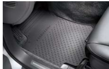
33 Rubber mat J501EXA000 / J501EXA100 / J501EXA000RH / J501EXA100RH Heavy duty rubber mat protects carpet from mud and snow.