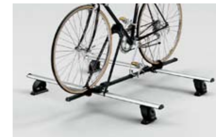
17 Bicycle holder (Basic) E361ESA701 Fits perfectly on the carrier base. *Aluminium carrier base required