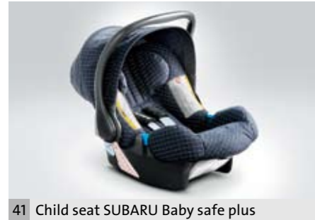
41 Child seat SUBARU Baby safe plus F410EYA102