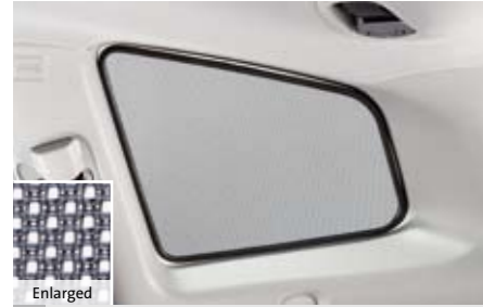
23 Sunshades (Rear quarter) F505EXA200 Protects from sunshine and darkens your luggage compartment. Mesh type. *Two sides