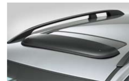
5 Moonroof air deflector F541SXA000 Helps reduce wind noise and cut sun glare. *For Sunroof equipped car