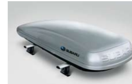
13 Transport box (Long) E361EYA900 Size: 2,267 x 805 x 355 mm. Volume: 430 litres. *Aluminium carrier base required