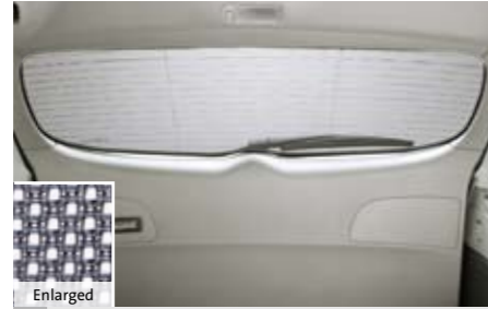
24 Sunshade (Rear gate) F505EXA000 Protects from sunshine and darkens your luggage compartment. Mesh type.