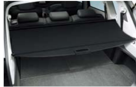
28 Tonneau cover (5+2 passengers) F5510XA000ML Enables to cover luggage compartment.