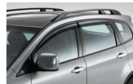
3 Side visor E3610XA000 Allows windows to stay open for ventilation during unsettled weather.