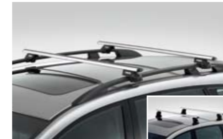
11 Aluminium carrier base E361EXA100 / E361EXA000 Perfectly fitting stylish base for carrier attachments.