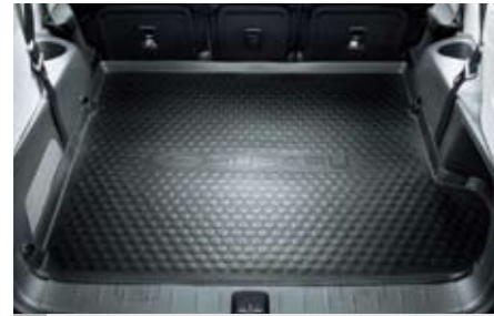
27 Cargo tray (5 passengers) J511EXA000 Protects cargo area floor from dust and dirt.