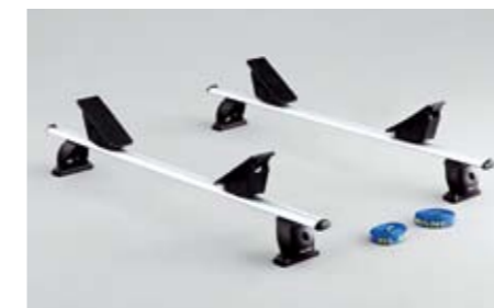
19 Kayak attachment E361EAG600 For 1 kayak. *Aluminium carrier base required