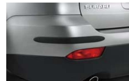
7 Rear bumper corner protector J1010LE200 Protects bumper corners.