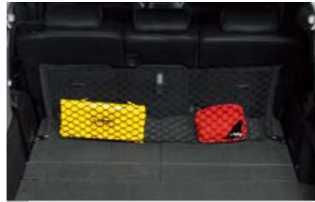
30 Cargo net (Rear seat back) F551SXA100 For a clean and tidy luggage area. Perfect complement to vertical cargo net.