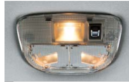
40 Dome/Rear reading lamps H461SXA000 Independent on/off control sends a focused beam of light to either left or right second seat passenger. *Cannot be combined with Rear seat DVD entertainment system