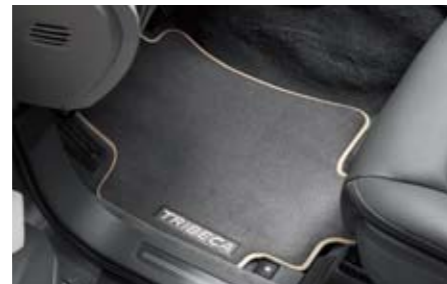
32 Carpet mat (Beige) J505EXA300 / J505EXA310 / J505EXA300RH / J505EXA310RH Custom fitted carpet mat with logo.