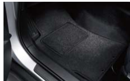
71 Carpet mat Black, Standard J505ESC101, J505ESC101RH Custom fitted carpet mat with logo. *Front & Rear set. J505ESC101: for L.H.D. vehicle. J505ESC101RH: for R.H.D. vehicle.