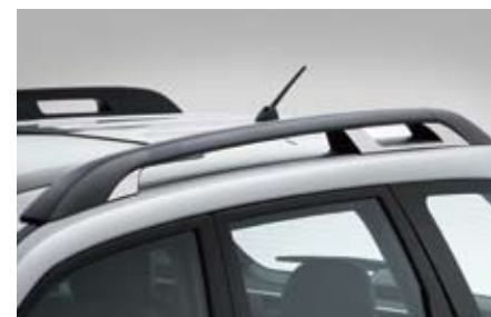
13 Roof rail moulding E755ESC700 Brushed silver finished mouldings add highlights to the roof rail area.