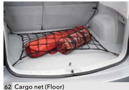
62 Cargo net (Floor) F5510SC000