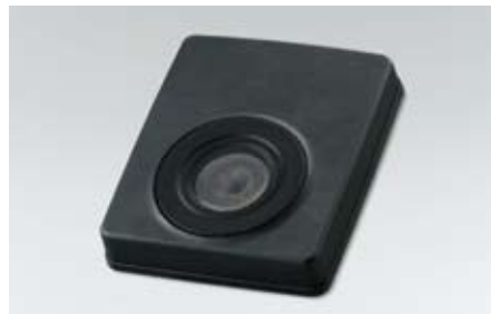
89 Subwoofer / Amplifier H630SSC100 Adds 120 watts of power, and delivers super bass sound you not only hear but feel. *Not compatible with factory installed Subwoofer.