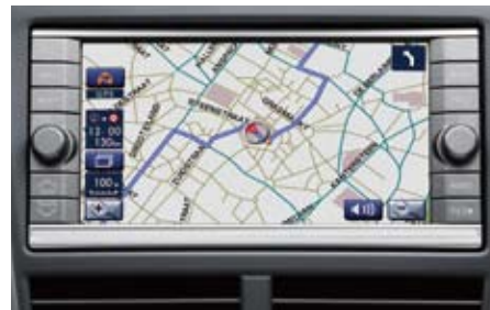
90 DVD-Navigation kit (L.H.D., R.H.D.) H001EFG001, H001EFG011 Exclusive design, user-friendly operation with touch screen and easy destination input. Includes radio, CD player, and DVD player. Bluetooth** handsfree pre-arranged. *Map is available only for the European countries.