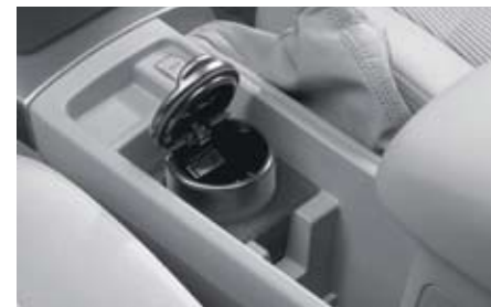
83 Round type ashtray F6010SC000, F6010AG000 Cup type ashtray exactly fits the centre cup holder. *F6010SC000: for AT, MT F6010AG000: for MT with dual range