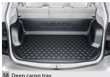
58 Deep cargo tray J515ESC200

Protects luggage space floor from dust and dirt. Also offers extra protection when the rear seats are folded flat.