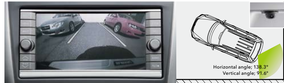
91 Rear view camera H0010SC150 High-resolution 250,000-pixel CCD camera that automatically displays the area around the rear of the car on the navigation screen when the reverse gear is selected. Has a horizontal angle view of 138.3° and a vertical angle view of 91.6°. *To be installed with NAVI.