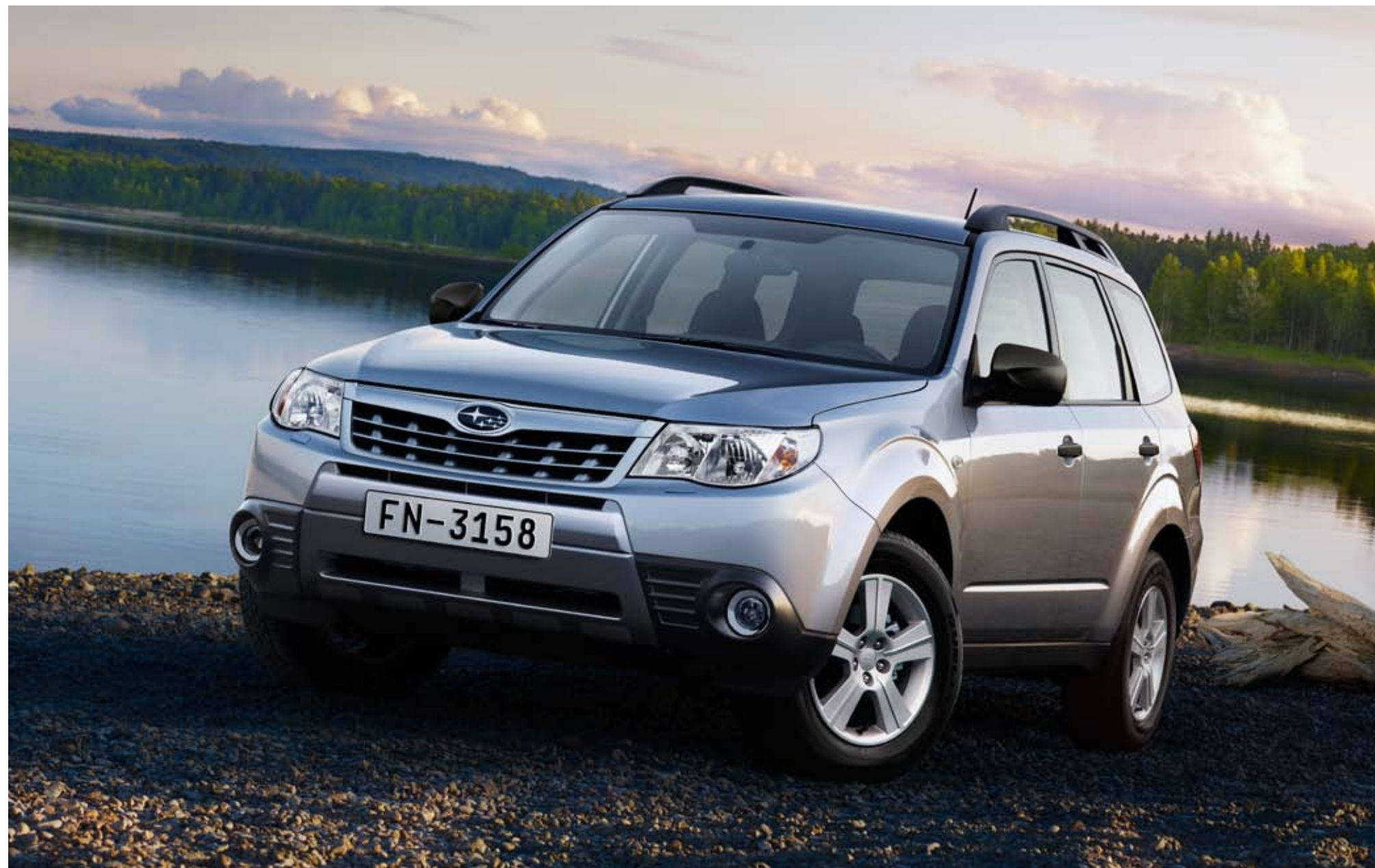
Image: vehicle is presented with Fog lamp kit and 16" alloy wheels.