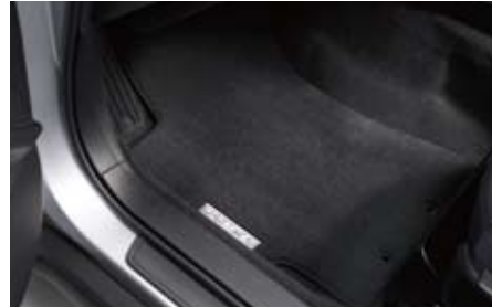
70 Carpet mat Black, Premium J505ESC201, J505ESC201RH Custom fitted carpet mat with logo. *Front & Rear set. J505ESC201: for L.H.D. vehicle. J505ESC201RH: for R.H.D. vehicle.