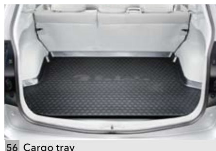
56 Cargo tray J515ESC000

Splits the luggage space into two sections, allowing two dogs to be held separately or for one dog to be separated from the luggage. *Only compatible with F555ESC200/F555ESC210.