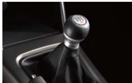
76 STI Shift knob, Aluminium & leather (5MT) C1010FG000 Designed for premium sports driving. Provides outstanding grip and vibration control.