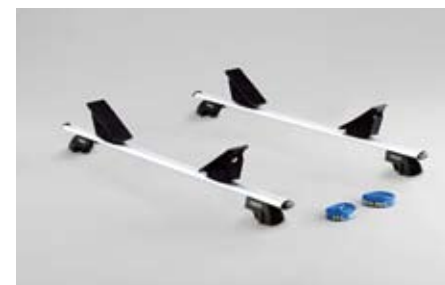
41 Kayak attachment E361EAG600

Size: 1,792 x 797 x 355 mm. Volume: 380 litres. *Carrier base required.