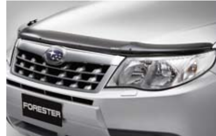
21 Hood deflector E235ESC000

Durable acrylic plastic and wraparound design help protect the hood from stone chips.