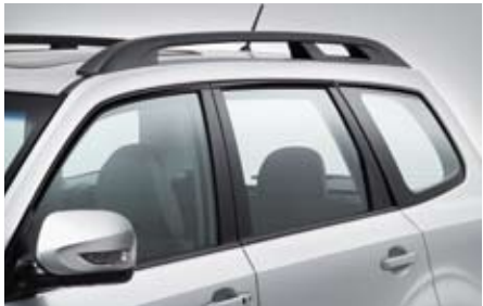
8 Piano black window moulding E755ESC110 Stylish piano black finished mouldings for the window contour give a very elegant touch.