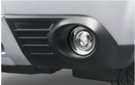
4 Fog lamp kit H4510SC010, H4510SC030 Enhances vision in inclement weather. *H4510SC010: for vehicle with Rear fog lamp. H4510SC030: for vehicle without Rear fog lamp.