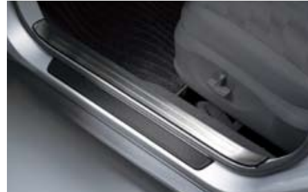
69 Side sill plate -Inner E1010SC100 Replaces existing sill plates with a more sporty look. *Front & Rear set.