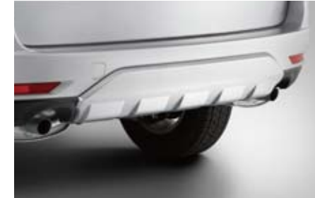
24 Rear bumper under guard E551SSC100

Helps protect body side. *J101SSC000NN: primed