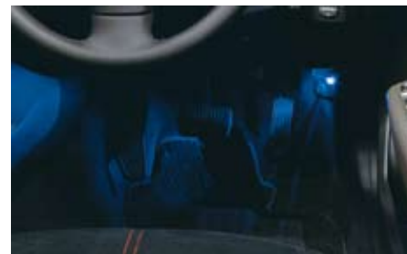
84 Twin foot lamp H7010SC000 Turns on automatically when the front door is opened or closed to light up the area around your feet. Makes getting in and out of the car in dark areas much easier. *Requires an installation kit: H0070SC100.