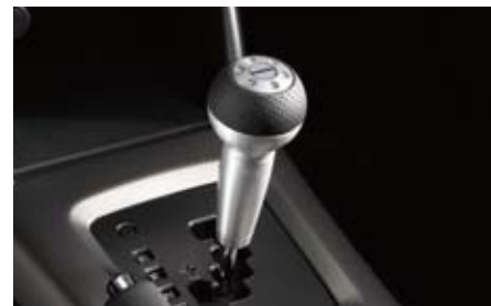
75 Aluminium sport shift knob (AT) C101ESA002 Stylish aluminium shift knob with Subaru logo.