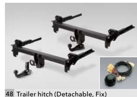
48 Trailer hitch (Detachable, Fix) See application list

Transports 3 bikes on tow ball. *Trailer hitch needed. E365EFG800: for 7 pin, E365EFG900: for 13 pin.