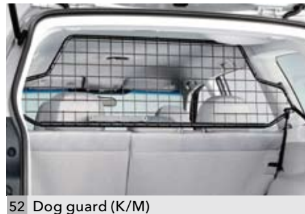
52 Dog guard (K/M) F555ESC000, F555ESC010

Protects from sunshine and darkens your luggage space. Mesh type.