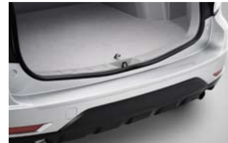
31 Cargo step protection foil (Clear) E775ESC100

Enhances the rough road image of your vehicle. *Not compatible with under spoiler.