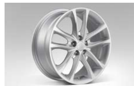
17 Alloy wheel 10-spoke (17 inch) B3110SC100 / B3110SC100K 17x7JJ offset 48 215/55R17, 225/55R17