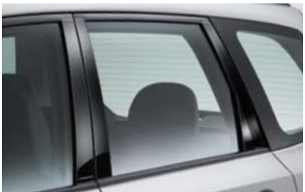
10 Piano black pillar garnish E755ESC500 Stylish piano black finished mouldings with Forester logo give a very elegant touch to the B/C pillar area.