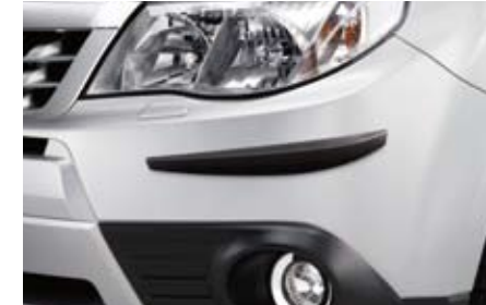
25 Bumper corner protector J105ESC000

Protects differential from protruding rocks and stones. *Installation kit required.