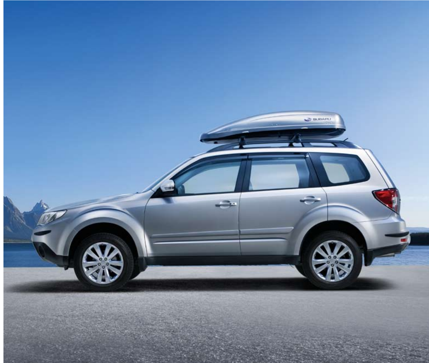
Image: vehicle is presented with Door visors, Side mouldings, Bumper corner protectors, Splash guards, Aluminium carrier base and Transport box (Short).