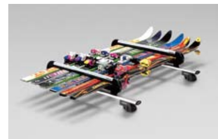
42 Ski attachment (Maximum 6 sets) E361EAG550

For 6 sets of skis or 4 snowboards. Usable width: 640 mm. *Carrier base required.