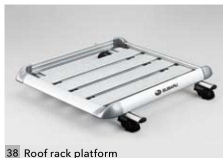
38 Roof rack platform E365ESC200

Perfectly fitting stylish base for carrier attachments.