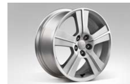
19 Alloy wheel 5-spoke (16 inch) 28111SC010 16x6.5JJ offset 48 215/65R16