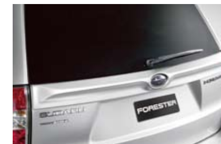
15 Waist spoiler J1210SC000NN Enhances the sporty look. *Painting required.