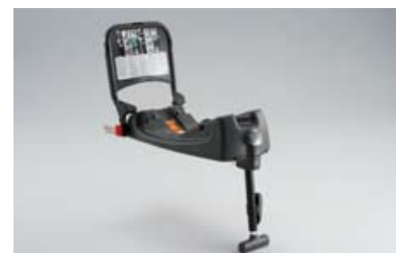
94 Childseat SUBARU Baby safe ISOFIX base F410EYA900 In order to install the childseat safely using ISOFIX anchor points. To be used together with F410EYA104.