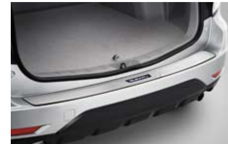
29 Cargo step panel (Stainless) E7710SC000

Protects bumper corners. *Front and Rear set.