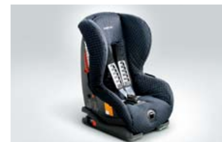
95 Childseat SUBARU Duo plus F410EYA002 Secure installation by ISOFIX.