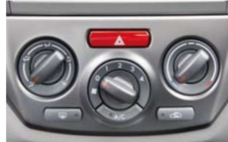
80 Air conditioner kit (L.H.D.) G3010SC310 After-fitment air conditioner. *Requires an AC fan kit: G3010SC500.