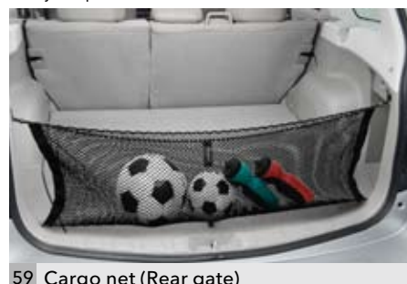
59 Cargo net (Rear gate) F551SSC101

Extra protection for the luggage space. Suitable for fishing and hunting.