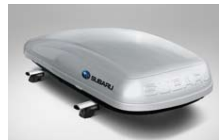
40 Transport box (Short) E361EYA801

Size: 2,267 x 805 x 355 mm. Volume: 430 litres. *Carrier base required.