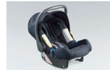
93 Childseat SUBARU Baby safe plus F410EYA104 Includes sun canopy.