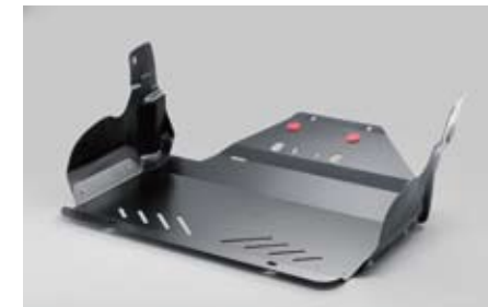
34 Engine under guard (Steel) E515ESC000 / E515ESC101

Rugged plastic resin cover helps protect upper surface of rear bumper.