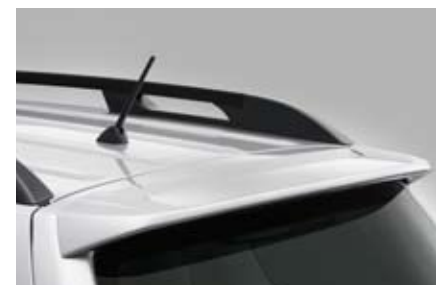
14 Roof spoiler kit E7210SC000NN Primed roof spoiler adds a sporty touch to your vehicle. *Painting required.