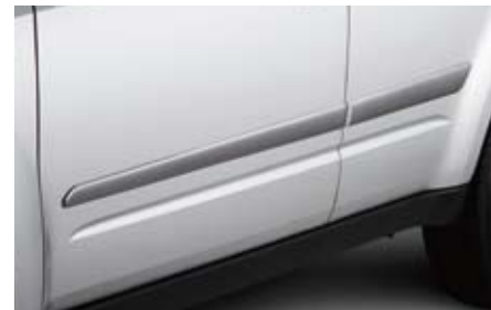
23 Side moulding J101SSC000NN

Helps protect your vehicle from stone-chips. *Not compatible with Front under spoiler.