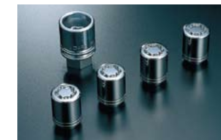
20 Wheel lock kit B327EYA000 Helps prevent alloy wheel and tyre theft.