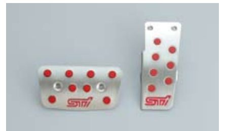
85 STI pedal pad kit (AT, L.H.D.) C8110AG010 Sporty looking set of pedals made of aluminium. *Not available for vehicle equipped with aluminium pedals.

FHI and STI have collaborated in order to create a concept of "total tuning" to emphasise the performance of the original vehicle.