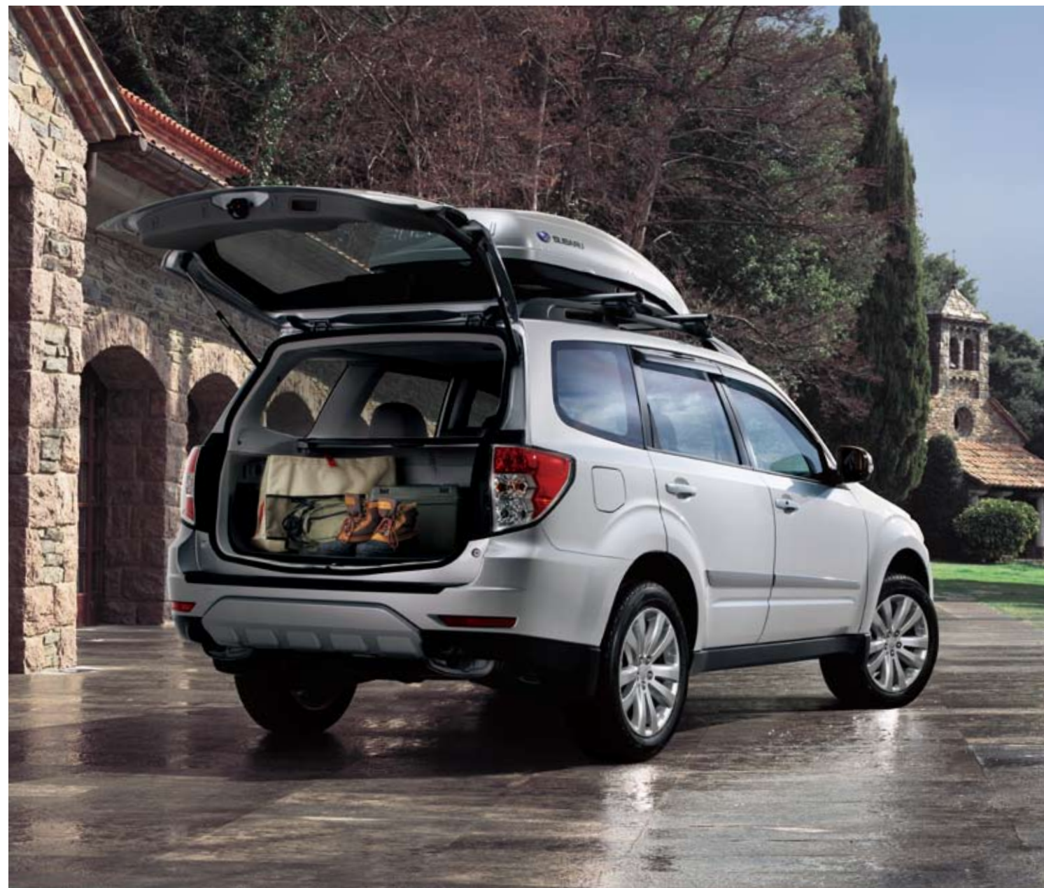
Image: vehicle is presented with Door visors, Side mouldings, Rear bumper under guard, Splash guards, Cargo step panel (Resin), Aluminium carrier base, Transport box (Short) and Deep cargo tray.