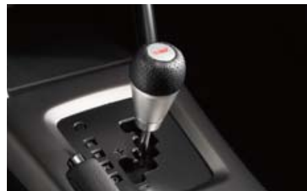
77 STI Shift knob (AT) C1010FG200 Stylish leather shift knob with STI logo.