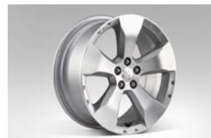
18 Alloy wheel 5-spoke (17 inch) 28111SC041 17x7JJ offset 48 215/55R17, 225/55R17