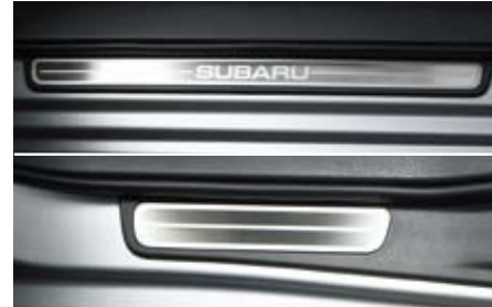
67 Side sill plate E1010FG000 Replaces existing sill plates with a more sporty look. *Front & Rear set.