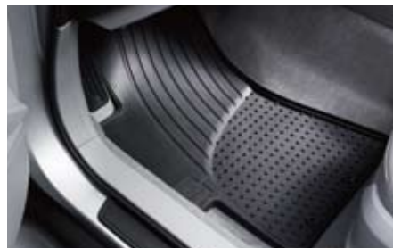
72 Rubber mat J505ESC003, J505ESC004RH Heavy duty rubber mat protects carpet from mud and snow. *Front & Rear set. J505ESC002: for L.H.D. vehicle. J505ESC004RH: for R.H.D. vehicle.