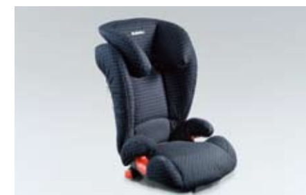
96 Childseat SUBARU KIDFIX F410EYA215 Secure installation by ISOFIX. Extra protection in case of side impact.