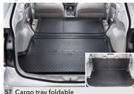
57 Cargo tray foldable J515ESC100

The floor panel is coated with aluminium that is easy to wipe clean, protecting the luggage space from dirt. *Luggage utility rail & hook required.