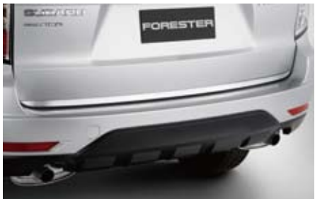
12 Chrome rear gate end moulding E755ESC000 Stylish chrome finished moulding.