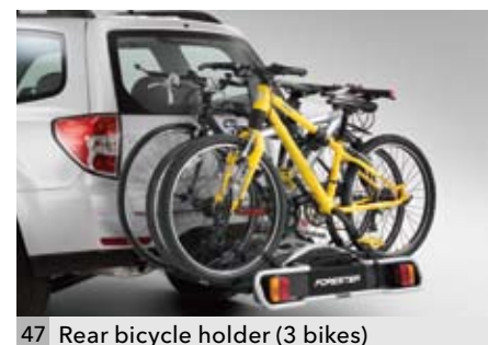
47 Rear bicycle holder (3 bikes) E365EFG800 / E365EFG900

Transports 2 bikes on tow ball. *Trailer hitch needed. E365EFG600: for 7 pin, E365EFG700: for 13 pin.