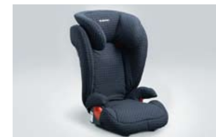
97 Childseat SUBARU KID F410EYA214 Extra protection in case of side impact.