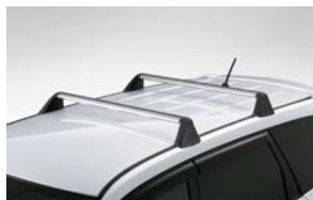
37 Aluminium carrier base (without roof rail) E3610SC500

Perfectly fitting stylish base for carrier attachments.