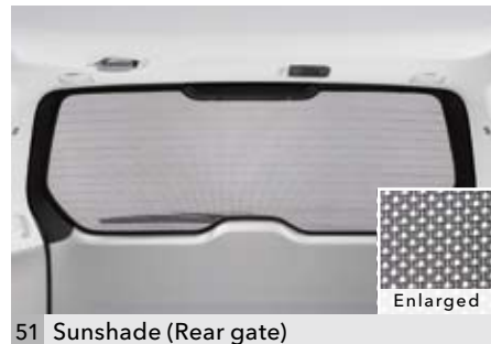
51 Sunshade (Rear gate) F505ESC000

Protects from sunshine and darkens your luggage space. Mesh type.