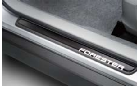
68 Piano black side sill moulding E755ESC600 Stylish piano black finished mouldings with Forester logo give a very elegant touch to the side sill area. *Front & Rear set.