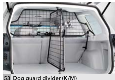
53 Dog guard divider (K/M) F555ESC100

Handy to separate luggage and to avoid it from sliding. *Luggage utility rail & hook required.