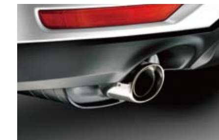
16 Muffler cutter D0510FG020 Stainless steel chrome extension for sporty look.