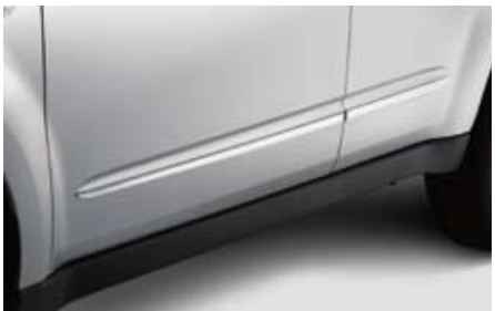
11 Chrome lower side door moulding E755ESC300 Stylish chrome finished mouldings add highlights to the side styling.