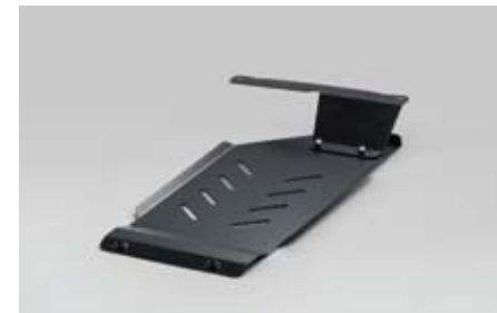
35 Transmission under guard (AT) E515ESC500

Helps protect upper surface of rear bumper.