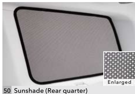
50 Sunshade (Rear quarter) F505ESC100

Protects from sunshine and darkens your passenger area. Mesh type.