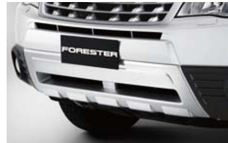
22 Front bumper under guard E551SSC000

Durable acrylic plastic and wraparound design help protect the hood from stone chips.