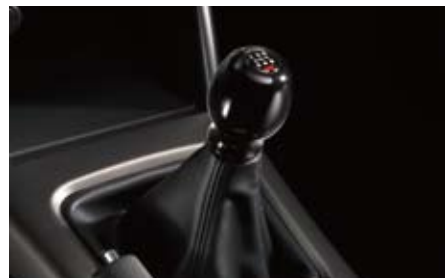
78 STI Shift knob, Duracon (5MT) C1010FG300 Shaped out of Duracon for more direct feeling and quicker gear shifting, lightweight, fatigue and wear resistant. *Duracon is a registered trademark of Polyplastics Co., Ltd.