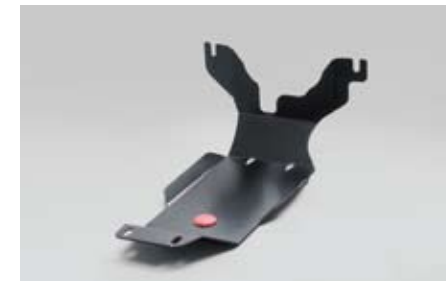
32 Rear differential guard E515ESC400

Helps reduce wind noise and cuts sun glare.