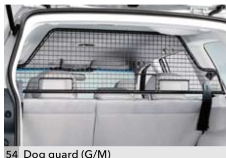
54 Dog guard (G/M) F555ESC200, F555ESC210

Splits the luggage space into two sections, allowing two dogs to be held separately or for one dog to be separated from the luggage. *Only compatible with F555ESC000/F555ESC010.