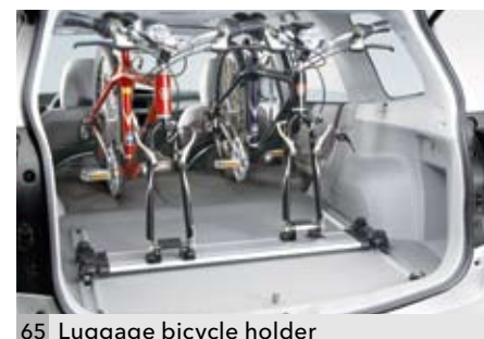
65 Luggage bicycle holder L0010SC020

Protects luggage space floor from dust and dirt.