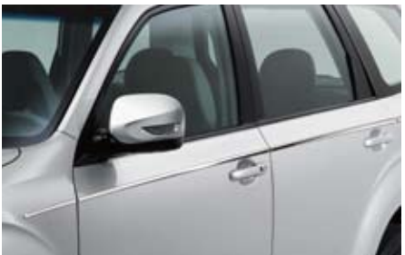
9 Chrome side moulding E755ESC200 Stylish chrome finished mouldings add highlights to the side styling.