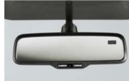
79 Compass mirror (L.H.D., R.H.D.) H501SSA101, H501SAG300 Includes electronic compass. Mirror darkens automatically when headlights are detected from the rear of the vehicle. *Requires an adapter kit: H5010SC000. R.H.D. vehicle also requires a Mounting adapter: H501SSA040.