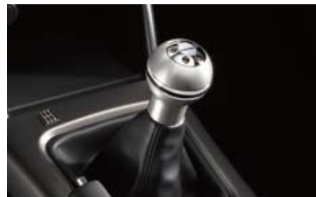
73 Aluminium sport shift knob, Black (5MT) C105EFE000 Stylish aluminium shift knob with Subaru logo.