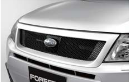
1 Front grille mesh type J1010SC100NN Mesh type insert which gives a whole new image to the front. *Painting required.