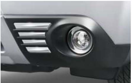
5 Chrome lower front corner moulding E755ESC400 Stylish chrome finished mouldings give a whole new look to the front bumper fog lamp area.