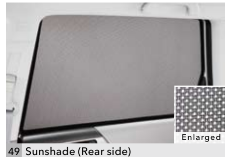
49 Sunshade (Rear side) F505ESC200

Protects from sunshine and darkens your passenger area. Mesh type.