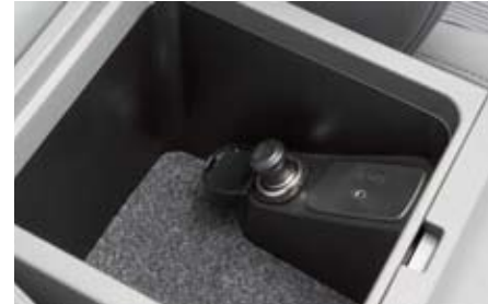
82 Cigarette lighter kit H6710FG000 Changes the accessory socket to a cigarette lighter.