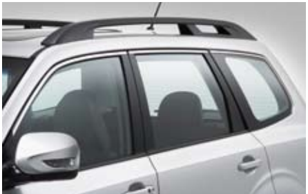
7 Chrome window moulding E755ESC100 Stylish chrome finished mouldings for the window contour give a very elegant touch.