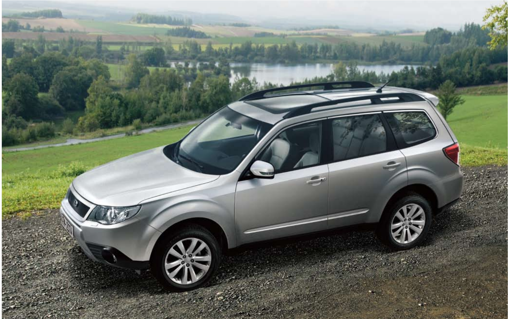
Image: vehicle is presented with Front grille mesh type, Chrome window mouldings, Chrome lower side door mouldings and Roof spoiler.