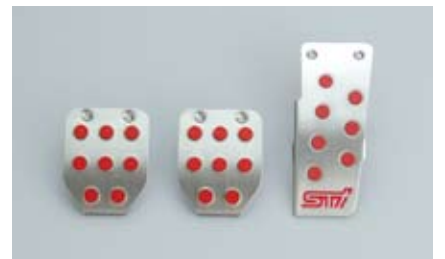
86 STI pedal pad kit (MT, L.H.D.) C8110AG000 Sporty looking set of pedals made of aluminium. *Not available for vehicle equipped with aluminium pedals.