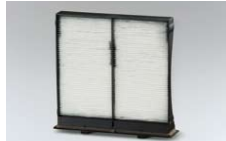
81 Air filter 72880FG000 Helps reduce dust and pollen infiltration into the vehicle cabin area. For the best result, it is recommended to replace the filter once a year or every 15,000 km. *For the replacement of originally equipped filter.