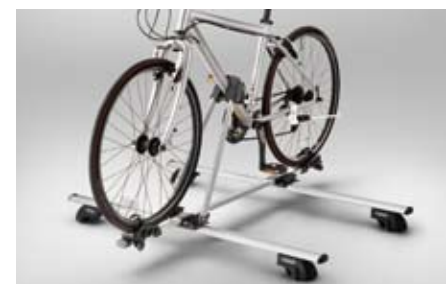
44 Bicycle holder (Basic) E365ESC100

For 4 sets of skis or 2 snowboards. *Carrier base required.