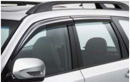
6 Door visor E3610SC000 Allows windows to stay open for ventilation during unsettled weather.