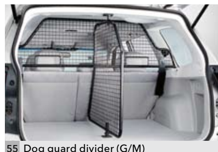
55 Dog guard divider (G/M) F555ESC300

Separates luggage space from passenger area, applicable for ISOFIX child seat. *F555ESC200: for vehicle with sunroof. F555ESC210: for vehicle without sunroof.