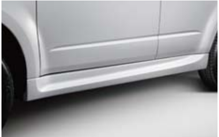
2 Side under spoiler E2610SC000NN Gives an aggressive performance look. *Painting required.