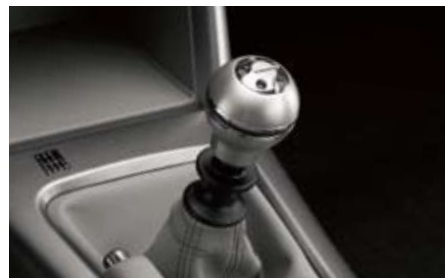
74 Aluminium sport shift knob, Black (6MT) C105ESC000 Stylish aluminium shift knob with Subaru logo.