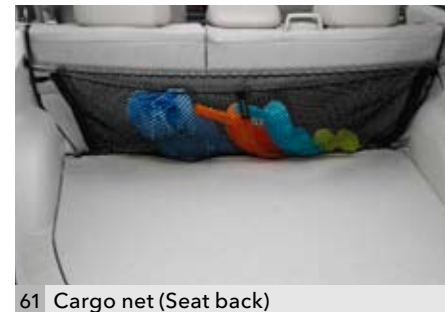
61 Cargo net (Seat back) F551SSC001

Separates luggage space from passenger area, applicable for ISOFIX child seat. *F555ESC000: for vehicle with sunroof. F555ESC010: for vehicle without sunroof.