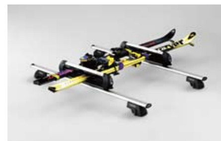
43 Ski attachment (Maximum 4 sets) E365EAG500

For 6 sets of skis or 4 snowboards. Usable width: 640 mm. *Carrier base required.