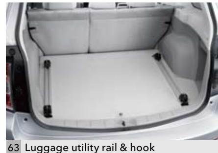
63 Luggage utility rail & hook L0010SC000

Used in conjunction with the luggage partition, bike carrier and floor panel.