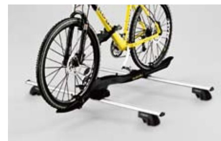
45 Bicycle holder (Barracuda) E361ESA501

Fits perfectly on the carrier base. *Carrier base required.