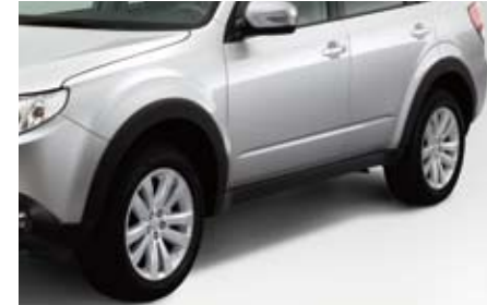
27 Fender flares J105ESC100

Protects engine and sump guard from protruding rocks and stones. *Installation kit and plastic side parts required.