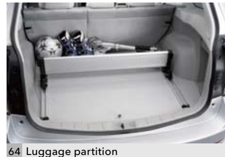
64 Luggage partition L0010SC010

Used in conjunction with the luggage partition, bike carrier and floor panel.