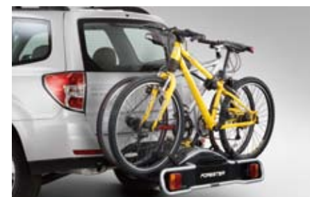
46 Rear bicycle holder (2 bikes) E365EFG600 / E365EFG700

Bike holder with aerodynamic design, easy bike installation. *Carrier base required.