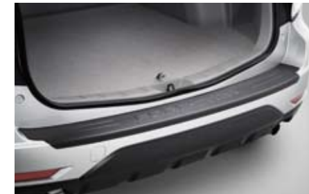
30 Cargo step panel (Resin) E775ESC000

Helps protect your vehicle from mud and snow.