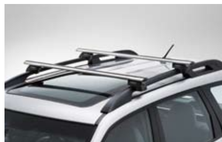
36 Aluminium carrier base (with roof rail) E365ESC000

Perfectly fitting stylish base for carrier attachments.