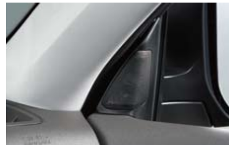
88 Tweeter kit for 1-CD Audio H6318SC000 Special speakers enhance high-frequency audio. *For factory installed 1-CD audio.