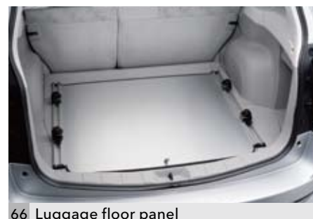
66 Luggage floor panel L0010SC030

Two bicycles with their front wheels removed can be stored even with 2 passengers in the car. *Luggage utility rail & hook required.