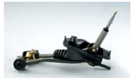
87 STI quick shift linkage 5MT C1010SC100, C1010SC000 Quick gear change and a more rigid & direct shift feeling. *Except for D/R transmission vehicle.