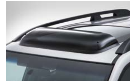
28 Sunroof deflector F541SSC000

Helps protect your vehicle from stone-chips. *Not compatible with Rear under spoiler. Cut-out required for Trailer hitch.