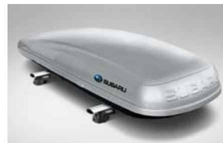
39 Transport box (Long) E361EYA900

Enhances your load carrying drastically. *Carrier base required.