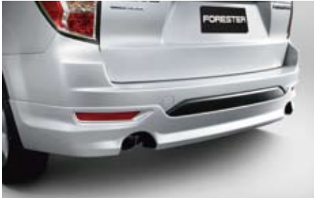
3 Rear under spoiler E5610SC000NN Gives an aggressive performance look. *Painting required. Not compatible with Rear bumper under guard and Fixed trailer hitch.