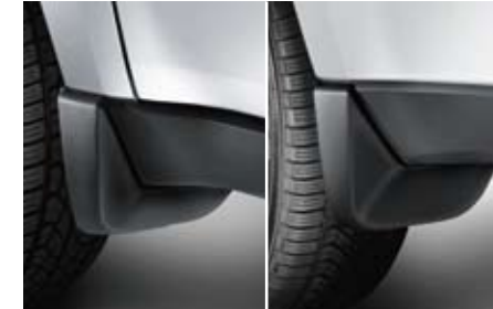
26 Splash guard (Front, Rear) J1010SC001, J1010SC004

Protects engine and sump guard from protruding rocks and stones. *Installation kit and plastic side parts required.