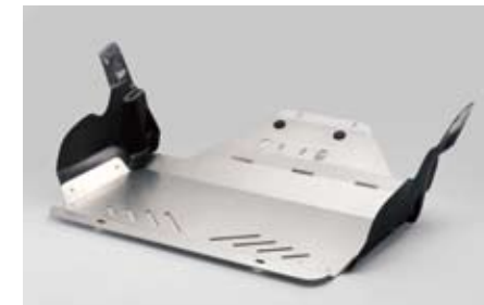
33 Engine under guard (Aluminium) E515ESC200 / E515ESC301

Protects engine and sump guard from protruding rocks and stones. *Installation kit and plastic side parts required.