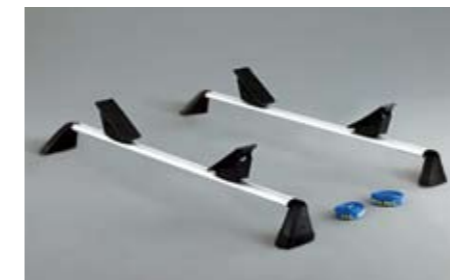
32 Kayak attachment E361EAG600 For 1 kayak. *Carrier base required.