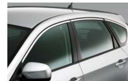
7 Chrome window moulding E755EFG100 Stylish chrome finished moulding for window contour gives a very elegant touch.