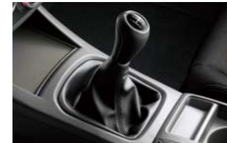
57 Leather shift knob (MT: Ivory, Offblack) 35022FG000, 35022AG000 Handsome leather-wrapped shift knob for 5-speed manual transmission.