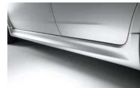
2 Side under spoiler E2610FG00NN Gives an aggressive performance look. *Painting required