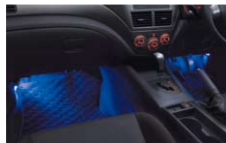
51 Twin foot lamp H7010FG000 Turns on automatically when the front door is opened or closed to light up the area around your feet. Makes getting in and out of the car in dark areas much easier.