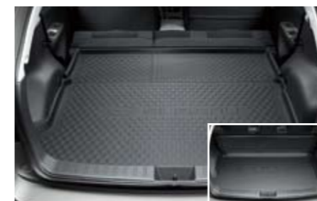
46 Cargo tray foldable J515EFG100 Protects cargo area floor from dust and dirt. Also offers extra protection when the rear seats are folded flat