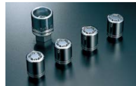
18 Wheel lock kit B327EYA000 Helps prevent alloy wheel and tyre theft.