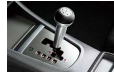
58 Aluminium sport shift knob (AT) C101ESA002 Stylish aluminium shift knob with Subaru logo.