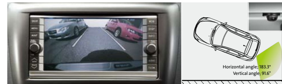
76 Rear view camera H0010FG000 High-resolution 250,000-pixel CCD camera that automatically displays the area around the rear of the car on the navigation screen when the reverse gear is selected. Has a horizontal angle view of 183.3° and a vertical angle view of 91.6°. *to be installed with NAVI.