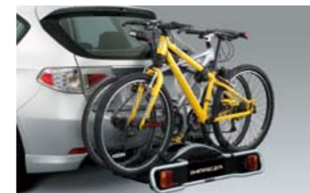
37 Rear bicycle holder (2 bike) E365EFG600 / E365EFG700 Transports 2 bikes on tow ball. *Trailer hitch needed.