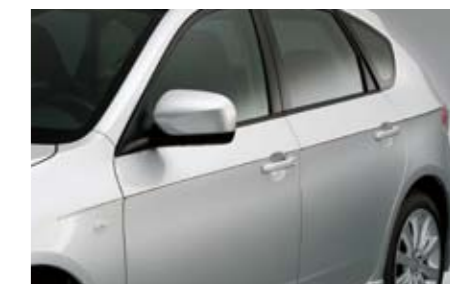
8 Chrome side moulding E755EFG200 Stylish chrome finished moulding adds highlights to the side styling.