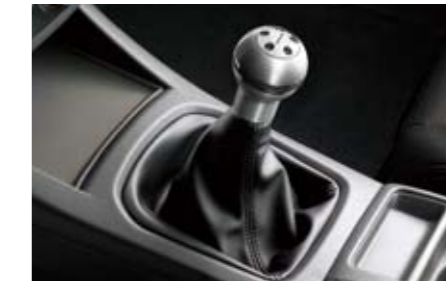
59 Aluminium sport shift knob (MT) C105EFE000 Stylish aluminium shift knob with Subaru logo.