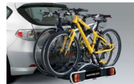
38 Rear bicycle holder (3 bike) E365EFG800 / E365EFG900 Transports 3 bikes on tow ball. *Trailer hitch needed.