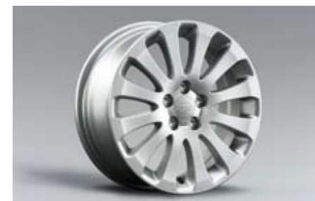
14 Alloy wheel (16 inch) 28111FG010