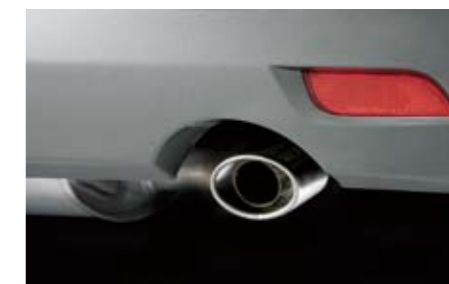
11 Muller cutter 1.5 D0510FG000 Stainless steel chrome extension for sporty look. *for European Market

Image: vehicle is presented with Front under spoiler, Side under spoiler, Rear under spoiler, Chrome window moulding, Chrome side moulding, Chrome rear gate end moulding.