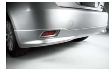
3 Rear under spoiler E5610FG00NN Gives an aggressive performance look. *Painting required