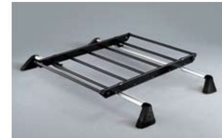
29 Roof rack platform E361EAG700 Enhances your load carrying drastically. *Carrier base required