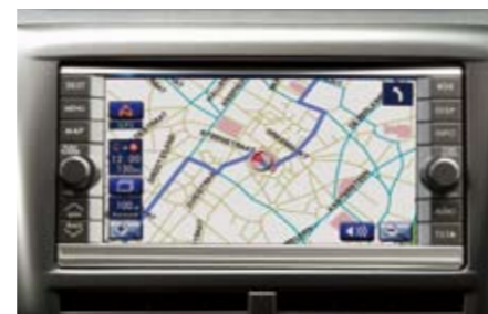
74 Navigation Kit (L.H.D., R.H.D.) H001EFG000, H001EFG010 Exclusive design, user-friendly operation with touch screen and easy destination input.

Image: vehicle is presented with Child seat SUBARU Duo plus.