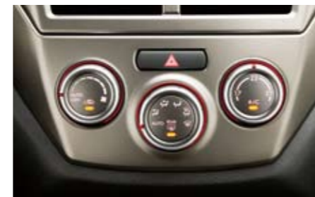
61 Air conditioner kit (L.H.D., R.H.D.) G3010FG110, G3010FG010 After-fitment air conditioner. *AC belt & fan kit required.