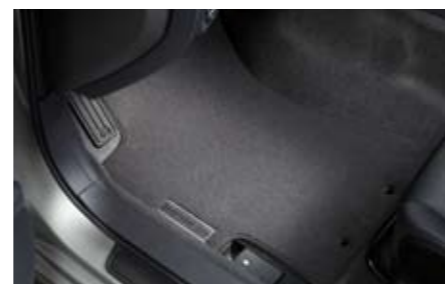
53 Carpet mat Gray, Premium J505EFG200, J505EFG200RH Custom fitted carpet mat with logo. *Front & Rear set