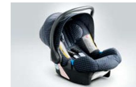
78 Childseat SUBARU Baby safe plus F410EYA102 Includes sun canopy.