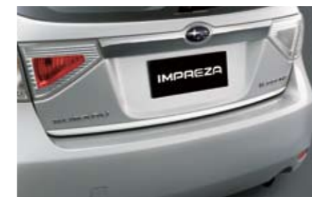
9 Chrome rear gate end moulding E755EFG000 Stylish chrome finished moulding.