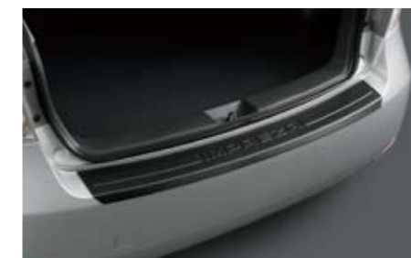
26 Cargo step panel (Resin) E775EFG000 Rugged plastic resin cover helps protect upper surface of rear bumper.