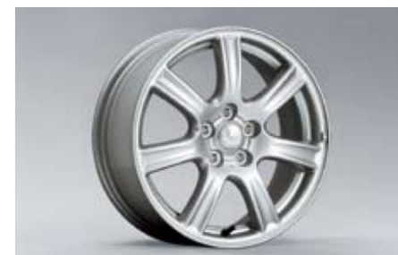
15 Alloy wheel 7-spoke (16 inch) 28111AG001