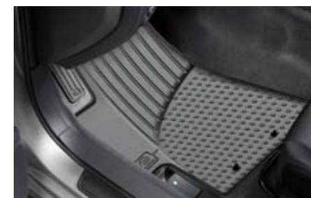
55 Rubber mat J505EFG000, J505EFG000RH Heavy duty rubber mat protects carpet from mud and snow. *Front & Rear set