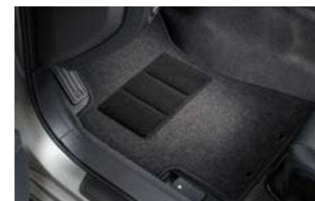
54 Carpet mat Gray, Standard J505EFG100, J505EFG100RH Custom fitted carpet mat. *Front & Rear set