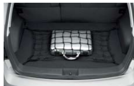
50 Cargo floor net J5510FG000 For a clean and tidy luggage area.