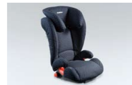
80 Childseat SUBARU KIDFIX F410EYA213 Secure installation by ISOFIX. Extra protection in case of side impact.