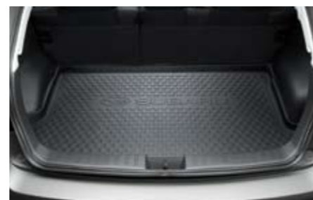
45 Cargo tray J515EFG000 Protects cargo area floor from dust and dirt.