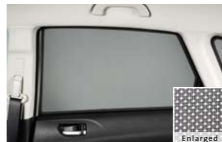
40 Sunshade (Rear side) F505EFG200 Protects from sunshine and darkens your luggage compartment. Mesh type.