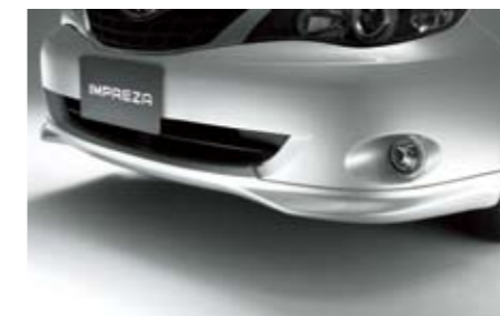
1 Front under spoiler E2410FG00NN Gives an aggressive performance look. *Painting required