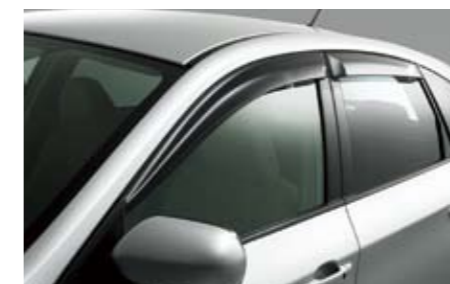
6 Door visor E3610FG000 Allows windows to stay open for ventilation during unsettled weather.