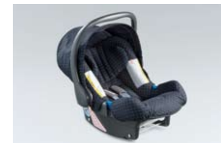
77 Childseat SUBARU Baby safe ISOFIX plus F410EYA103 Secure installation by ISOFIX. Includes sun canopy.