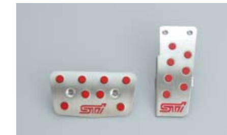
68 STI pedal pad kit AT C8110AG010 Sporty looking set of pedals made of aluminium. *For L.H.D. without pedal covers