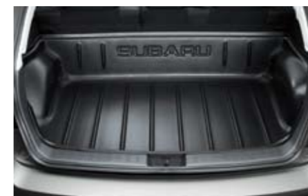
47 Deep cargo tray J515EFG200 Extra protection for the load area. Suitable for fishing and hunting.