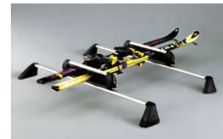
34 Ski attachment (Maximum 4sets) E361EAG500 For 4 sets of skis or 2 snowboards. *Carrier base required.