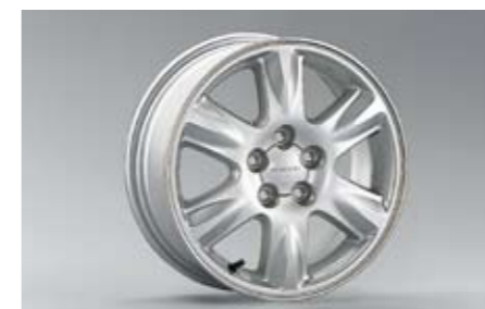
17 Alloy wheel 6-spoke (15 inch) 28111SA011