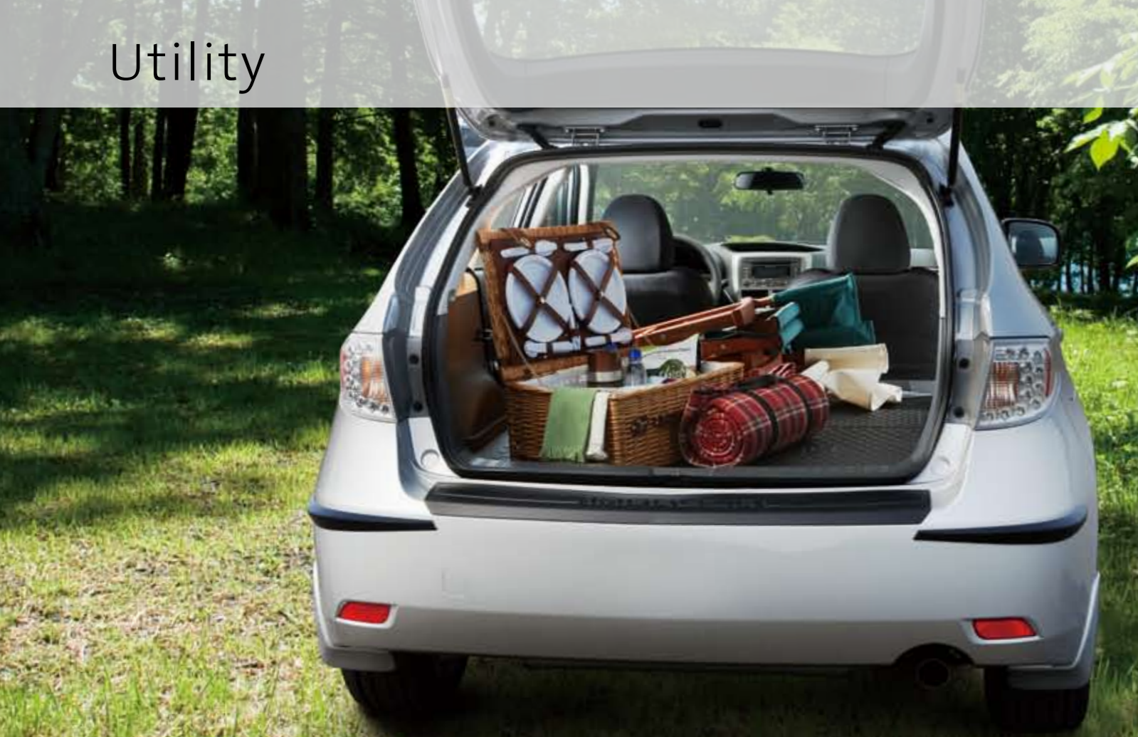
Image: vehicle is presented with Bumper corner protector, Splash guard, Cargo step panel (Resin), Foldable cargo tray.