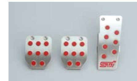
67 STI pedal pad kit MT C8110AG000 Sporty looking set of pedals made of aluminium. *For L.H.D. without pedal covers

FHI and STI have collaborated in order to create a concept of "total tuning" to emphasise the performance of the original vehicle.