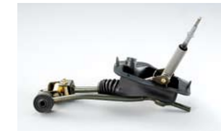
69 STI quick shift linkage 5MT C1010AG001 Quick gear change and a more rigid & direct shift feeling. *Except for Dual-range transmission vehicle

Image: vehicle is presented with Aluminium shift knob, Round type ash tray, Dual console box, Navigation kit.