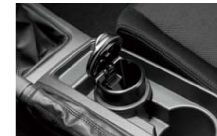
64 Round type ash tray F6010FG000 Cup type ashtray exactly fits the centre cup holder.