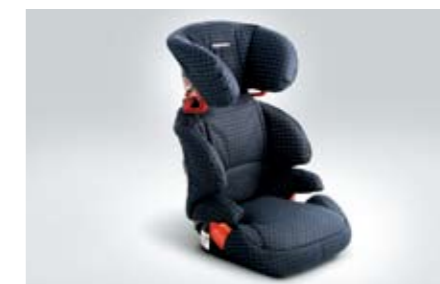
81 Child seat SUBARU KID plus F410EYA212 Extra protection in case of side impact.