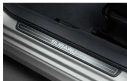
52 Side sill plate E1010FG000 Attaches onto existing sill plates to give a more sporty look *Front and Rear set