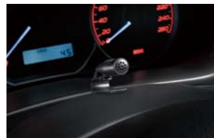
75 Hands free microphone H0018FG300 Allows cordless, handsfree communication when used with a mobile phone fitted with a Bluetooth adapter.