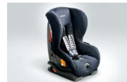
79 Childseat SUBARU Duo plus F410EYA002 Secure installation by ISOFIX.