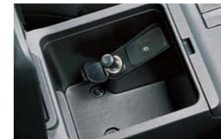
63 Cigarette lighter kit H6710FG000 Changes the accessory socket to a cigarette lighter.