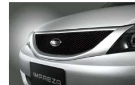
4 Front grille (mesh type) J1010FG100NN Mesh type insert which gives a whole new image to the front. *Painting required