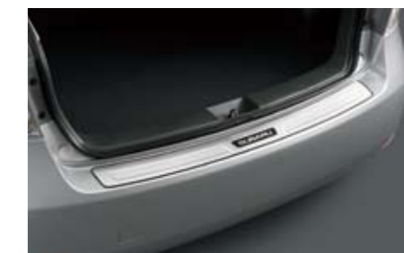
25 Cargo step panel (Stainless) E7710FG000 Protects rear bumper from scratches.