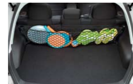
49 Cargo net (Rear seat back) F551SFG200 For a clean and tidy luggage area. Perfect complement to vertical cargo net.