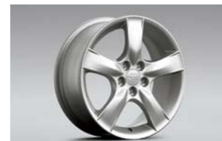
16 Alloy wheel 5-spoke (16 inch) 28111FE311