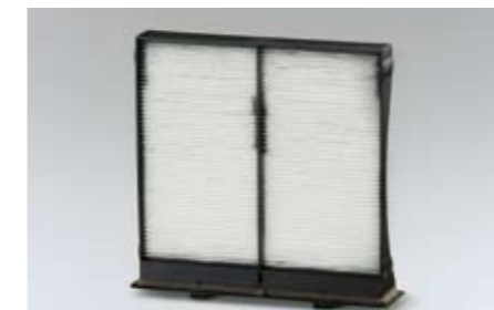
62 Air filter 72880FG000 Helps reduce dust and pollen infiltration into the vehicle cabin area. For the best result, it is recommended to replace the filter once a year or every 12,000 km. *For the replacement of originally equipped filter.