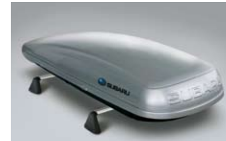
30 Transport box (Long) E361EYA900 Size: 2,267 x 805 x 355 mm. Volume: 430 litres. *Carrier base required.