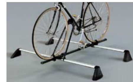
35 Bicycle holder (Basic) E361ESA701 Fits perfectly on the carrier base. *Carrier base required.