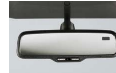
60 Compass mirror (L.H.D., R.H.D.) H5015FG000, H5015AG300 Includes electronic compass. Mirror darkens automatically when headlights are detected from the rear of the vehicle. *Requires an adaptor kit.