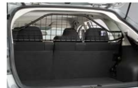
43 Dog guard (K/M) F555EFG000 Separates cargo room from passenger area, applicable for ISOFIX child seat.