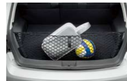
48 Cargo net (Vertical) F551SFG100 For a clean and tidy luggage area.