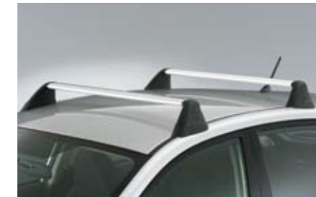
28 Aluminium carrier base E3610FG500 Perfectly fitting stylish base for carrier attachments.