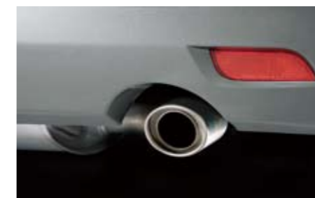
10 Muller cutter 2.0 44370FG020 Stainless steel chrome extension for sporty look.