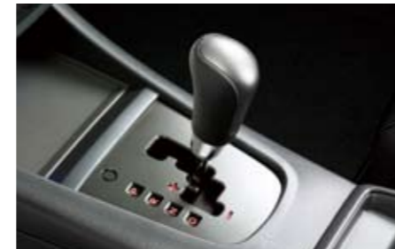
56 Leather shift knob (AT: Ivory, Offblack) 35160FG010WJ, 35160FG010JC Handsome leather-wrapped shift knob for automatic transmission.