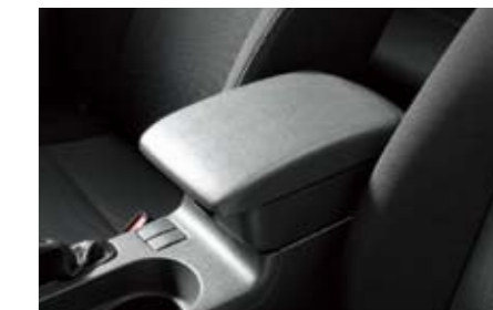
65 Dual console box (Ivory, Off black) J2010FG000WJ, J2010FG000MG Extra storage within existing centre armrest console.