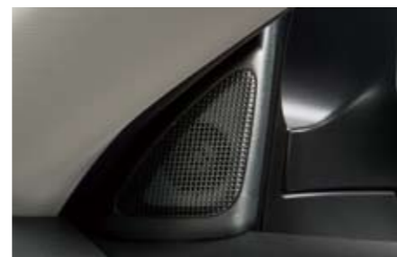
71 Tweeter kit H6310FG000 Special speakers enhance high-frequency audio. *For factory installed TCD audio.

Image: vehicle is presented with Child seat SUBARU Duo plus.