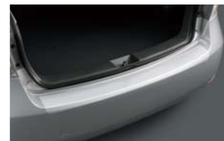
27 Cargo step protection foil (Clear) E775EFG100 Helps protect upper surface of rear bumper.