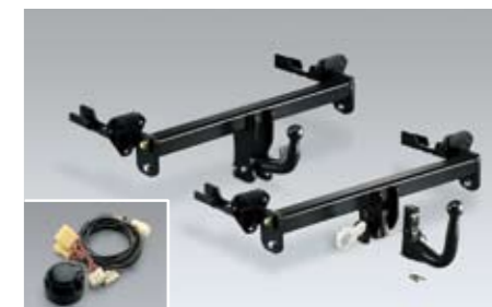
39 Trailer hitch (Detachable, Fix) See application list *For European Market. Maximum towing capacity may vary according to the vehicle specification. Please contact your dealer for details.