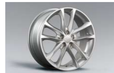
12 Alloy wheel (17 inch) B3110FG100