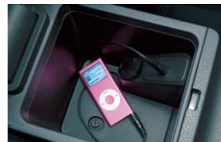
70 AUX outlet kit H6210FG000 A 3.5 mm auxiliary stereo mini-pin jack socket that allows you to listen to the sounds from portable music players. Now you can enjoy your own music through the car speakers. *For factory installed TCD audio.