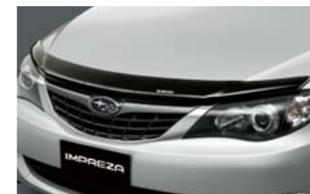
22 Hood deflector E231SFG010 Durable acrylic plastic and wraparound design help protect the hood from stone chips.