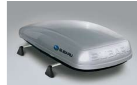
31 Transport box (Short) E361EYA801 Size: 1,792 x 797 x 355 mm. Volume: 380 litres. *Carrier base required.