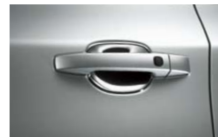
23 Door handle protector F0010FG050 Chrome plated plastic protector to protect your fingers and the doors from scratches.