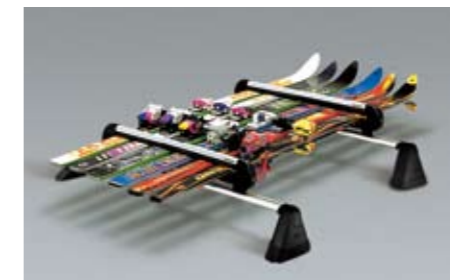
33 Ski attachment (Maximum 6sets) E361EAG550 For 6 sets of skis or 4 snowboards. Usable width: 640 mm. *Carrier base required.