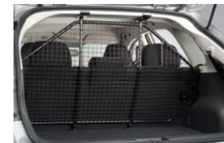
44 Dog guard (G/M) F555EFG100 Separates cargo room from passenger area, applicable for ISOFIX child seat.