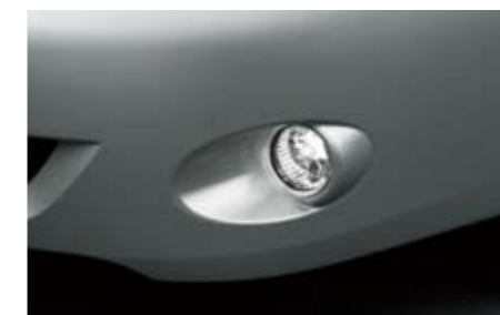
5 Fog lamp kit H4510FG010 / H4510FG020 Enhances vision in inclement weather. *H4510FG010: Except for KA spec. H4510FG020: Only for KA spec.