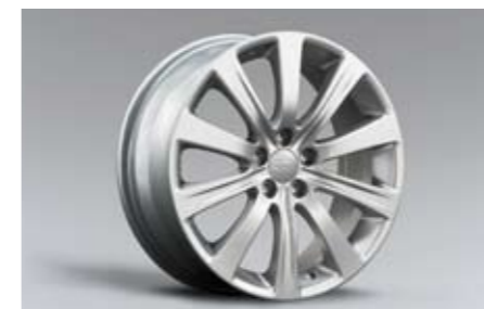
13 Alloy wheel (17 inch) 28111FG020