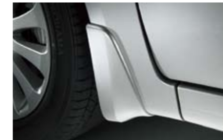
21 Splash guard (Rear set) J1010FG014NN Helps protect your vehicle from mud and snow. *Painting required