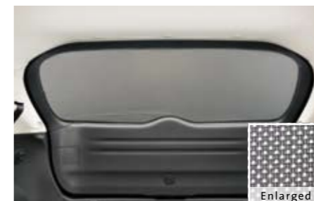
42 Sunshade (Rear gate) F505EFG000 Protects from sunshine and darkens your luggage compartment. Mesh type.