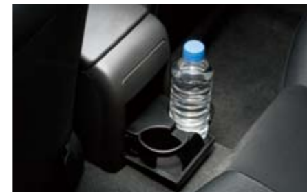
66 Rear cup holder (Ivory, Off black) J2010FG010WJ, J2010FG010MG Cup holder for the rear passengers that can be neatly stored at the back of the centre console.