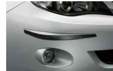
19 Bumper corner protector kit (Front & Rear set) J105EFG000 Protects bumper corners.