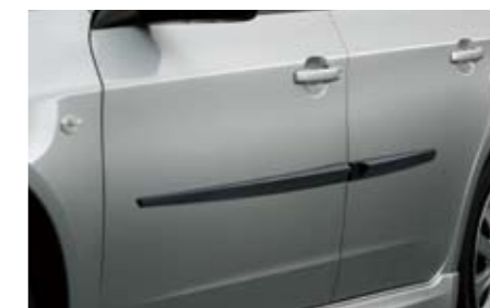
24 Side protector J105EFG100 Helps protect body side.