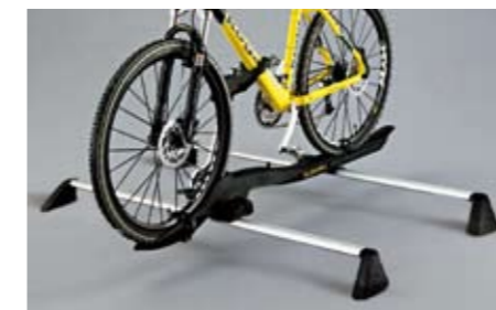
36 Bicycle holder (Barracuda) E361ESA501 Bike holder with aerodynamic design, easy bike installation. *Carrier base required.