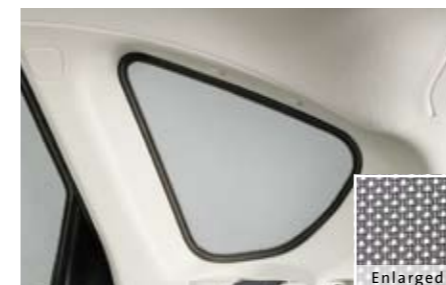
41 Sunshade (Rear quarter) F505EFG100 Protects from sunshine and darkens your luggage compartment. Mesh type.