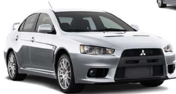
Lancer Evolution GSR shown with optional equipment.

BLACK LEATHER AND SUEDED PHANTOM BLACK TRIM