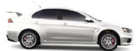
WICKED WHITE / BLACK INTERIOR