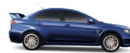
OCTANE BLUE PEARL / BLACK INTERIOR (GSR EXCLUSIVE)