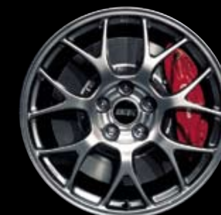
18-INCH ALLOY WHEELS