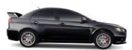
PHANTOM BLACK PEARL / BLACK INTERIOR (MR EXCLUSIVE 1 )