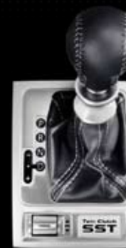
TWIN CLUTCH SPORTRONIC® SHIFT TRANSMISSION

INTRODUCING THE NEXT GENERATION OF PERFORMANCE, THE 2008 MITSUBISHI LANCER EVOLUTION. IT'S THE MOST POWERFUL, MOST AGILE, MOST TECHNOLOGICALLY ADVANCED LANCER EVOLUTION WE'VE EVER BUILT. THIS ENTIRELY REDESIGNED AND REENGINEERED EVOLUTION IS MORE IMPRESSIVE IN EVERY CATEGORY, INSIDE AND OUT. ONE GLANCE AT ITS SLEEK NEW EXTERIOR WILL MAKE THAT CLEAR. AND ONE BREATHTAKING DRIVE WILL LEAVE NO DOUBT THAT FOR ASTOUNDING PERFORMANCE, IT'S THE NATURAL SELECTION.