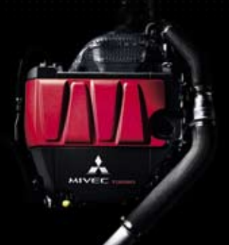
291-HORSEPOWER TURBOCHARGED ENGINE