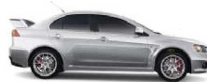
APEX SILVER METALLIC / BLACK INTERIOR