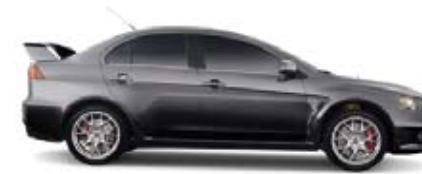
GRAPHITE GRAY PEARL / BLACK INTERIOR