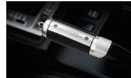
PARKING BRAKE GRIP