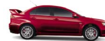
RALLY RED METALLIC / BLACK INTERIOR